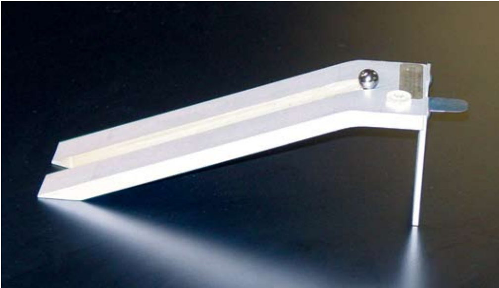
Figure 1. Rolling ball apparatus components.